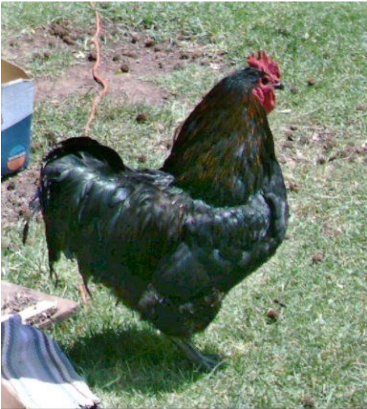
Figure 10: Jersey Giant Rooster by AlishaV. (http://creativecommons.org/licenses/by/2.0/deed.en)