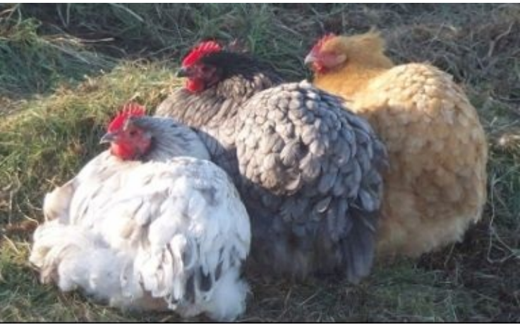
Figure 15: Splash, Blue and Buff Orpington.