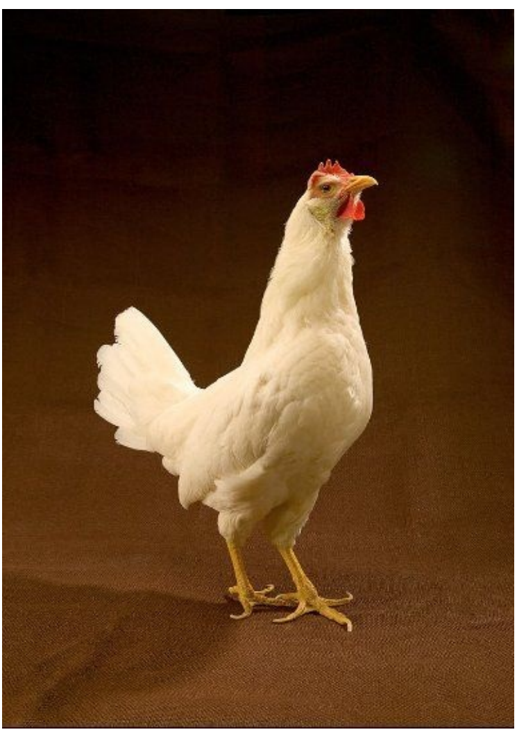
Figure 12: Leghorn hen.