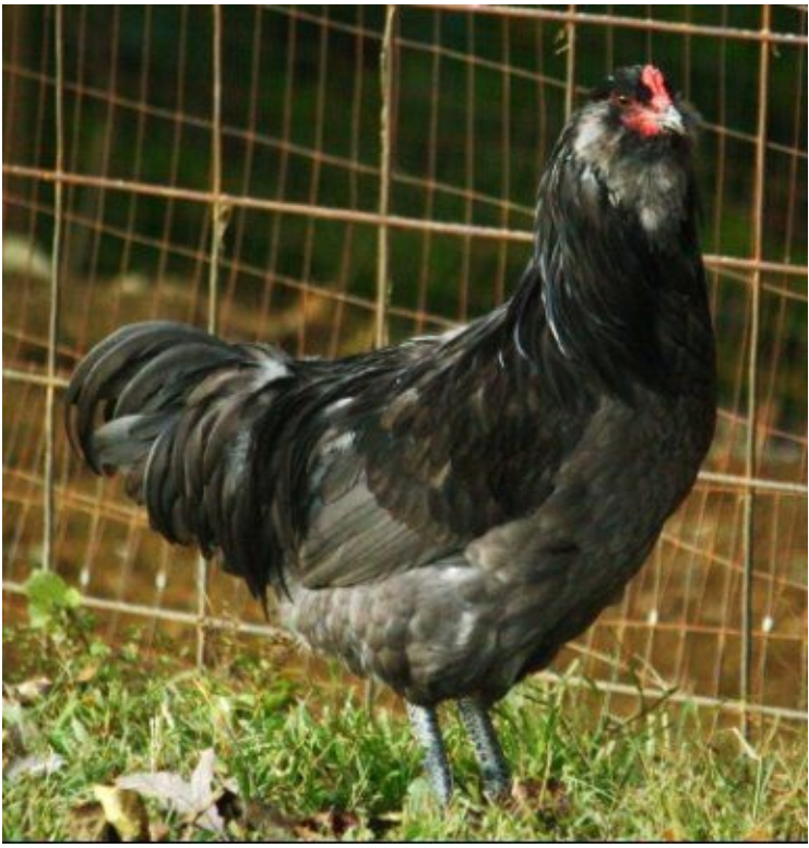
Figure 2: Ameraucana rooster.