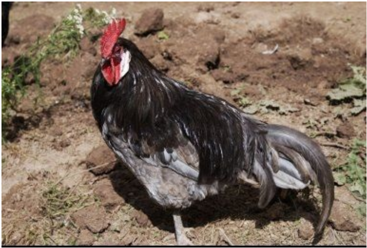
Figure 3: Blue Andalusian By Костюшко (Own work) [CC-BY-SA-3.0 (http://creativecommons.org/licenses/by-sa/3.0) or GFDL (http://www.gnu.org/copyleft/fdl.html)], via Wikimedia Commons