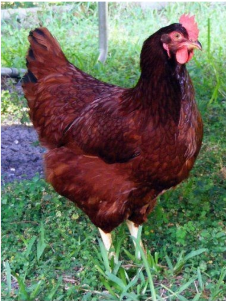
Figure 17: Rhode Island Red. By Erica Zahn (Own work)