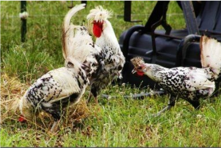
Figure 4: Appenzeller Spitzhauben.