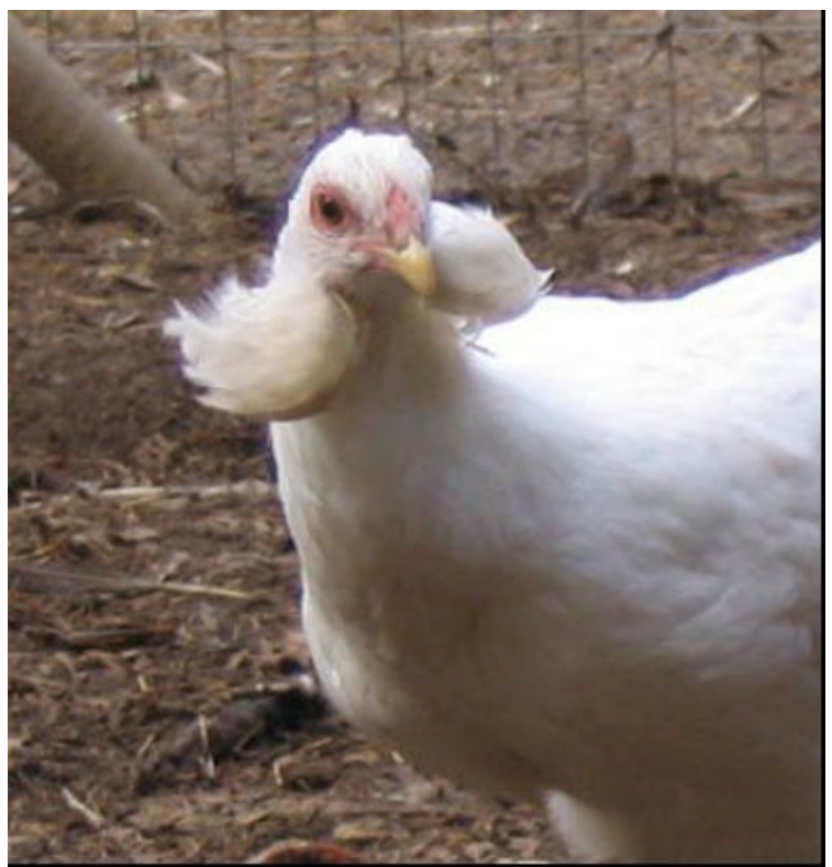
Figure 5: Araucana hen.