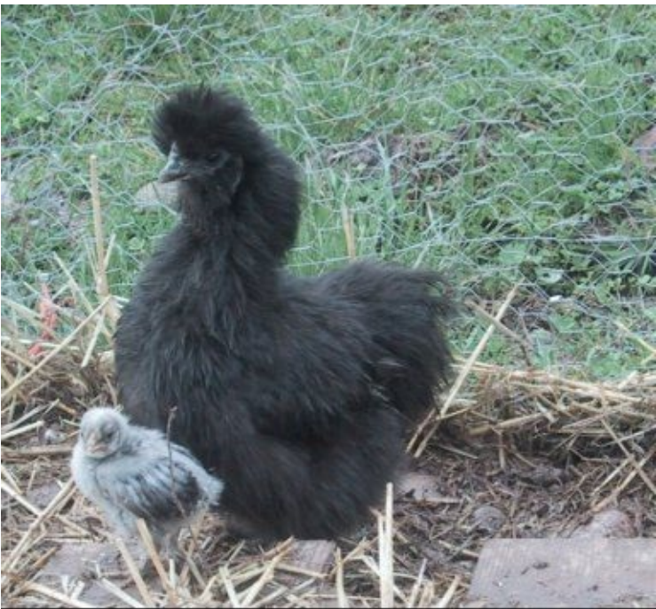
Figure 18: By Wim Lewis from Seattle, USA (A fuzzy baby chicken (and its mom)) [CC-BY-2.0 (http://creativecommons.org/licenses/by/2.0)], via Wikimedia Commons