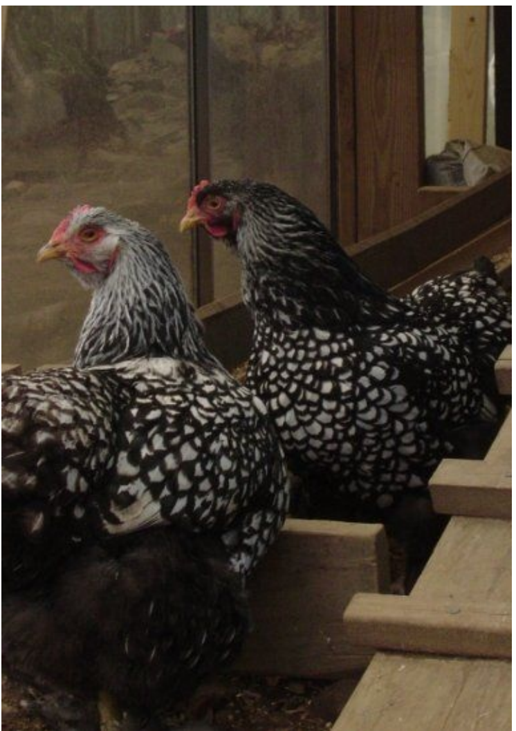
Figure 20: Silver-laced Wyandottes.