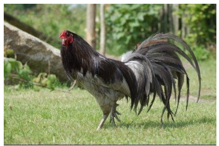
Figure 19: Sumatra hen.