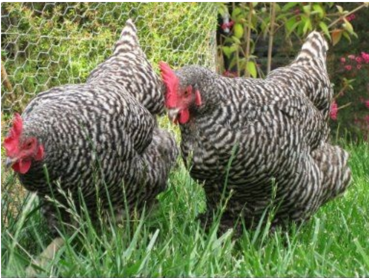
Figure 16: (Sophia and ZsuZsu walking the property)