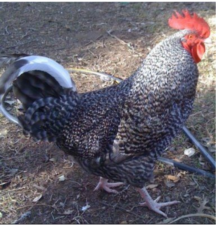
Figure 13: Cuckoo Marans. By Libralove (Own work)