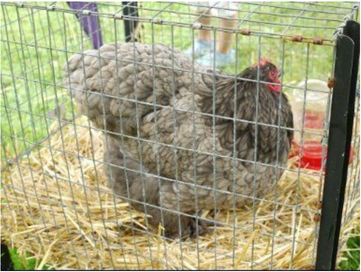
Figure 9: Cochin hen. By grongar (Chicken) [CC-BY-2.0 (http://creativecommons.org/licenses/by/2.0)], via Wikimedia Commons