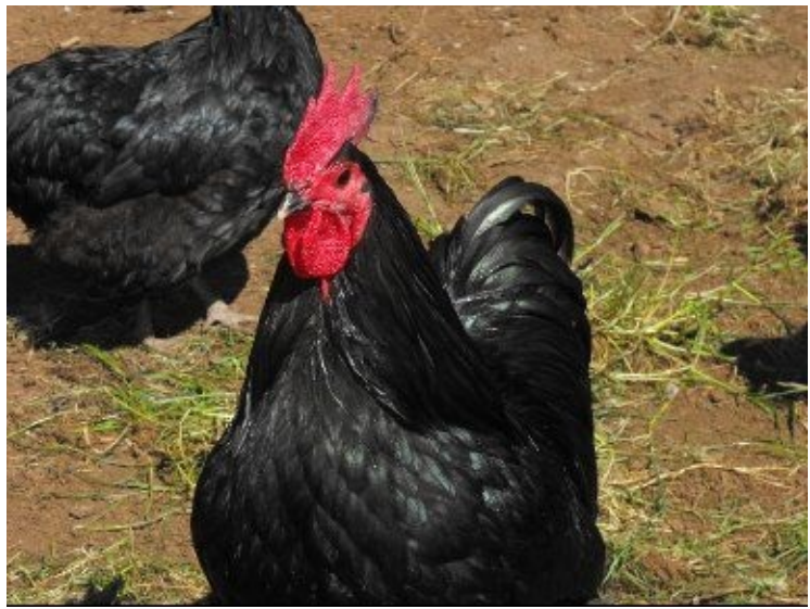
Figure 6: Australorp rooster. By Anjwalker (Own work) [CC-BY-3.0 (http://creativecommons.org/licenses/by/3.0)], via Wikimedia Commons