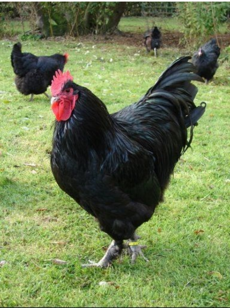
Figure 11: Outback hens at the English language Wikipedia CC-BY-SA-3.0 (http://creativecommons.org/licenses/by-sa/3.0/)], from Wikimedia Commons