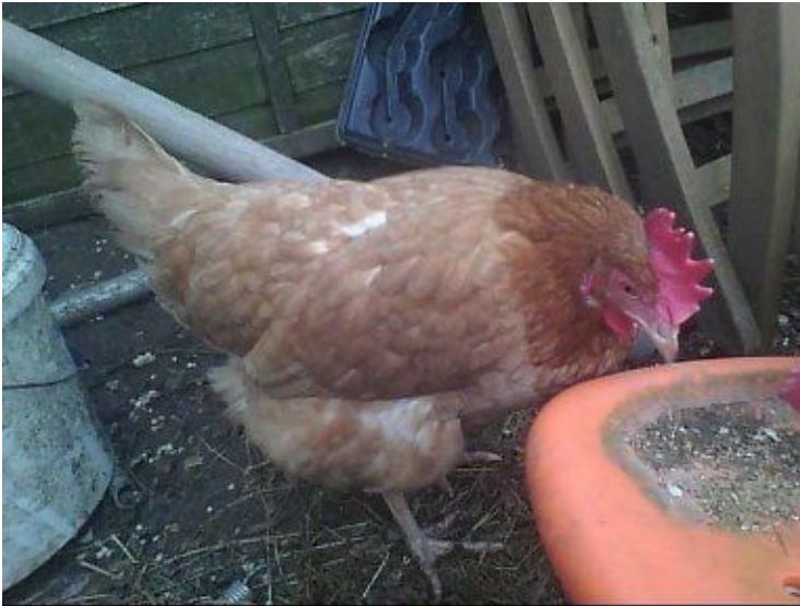
Figure 14: New Hampshire hen.